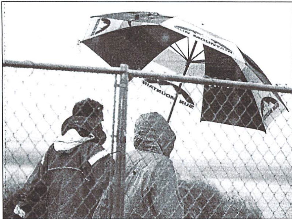
Umbrellas were in abundance during the Island Creek Oyster Festival this year.